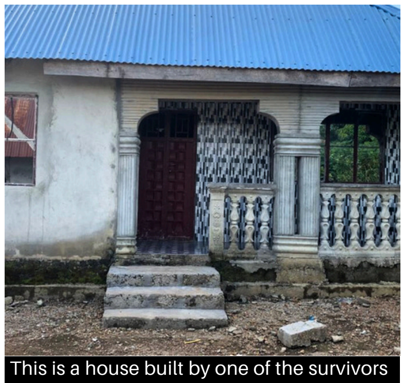
This is a house built by one of the survivors

Today, the survivor story is one of triumph over adversity. His resilience, combined with the support and dedication of True Hope Foundation International, has allowed him to reclaim his life, find healing, and provide for his family. His journey also served as the inspiration behind True Hope Foundation International, which now helps countless others in need. His story stands as a powerful reminder that even the darkest journeys can lead to new beginnings and lasting change.