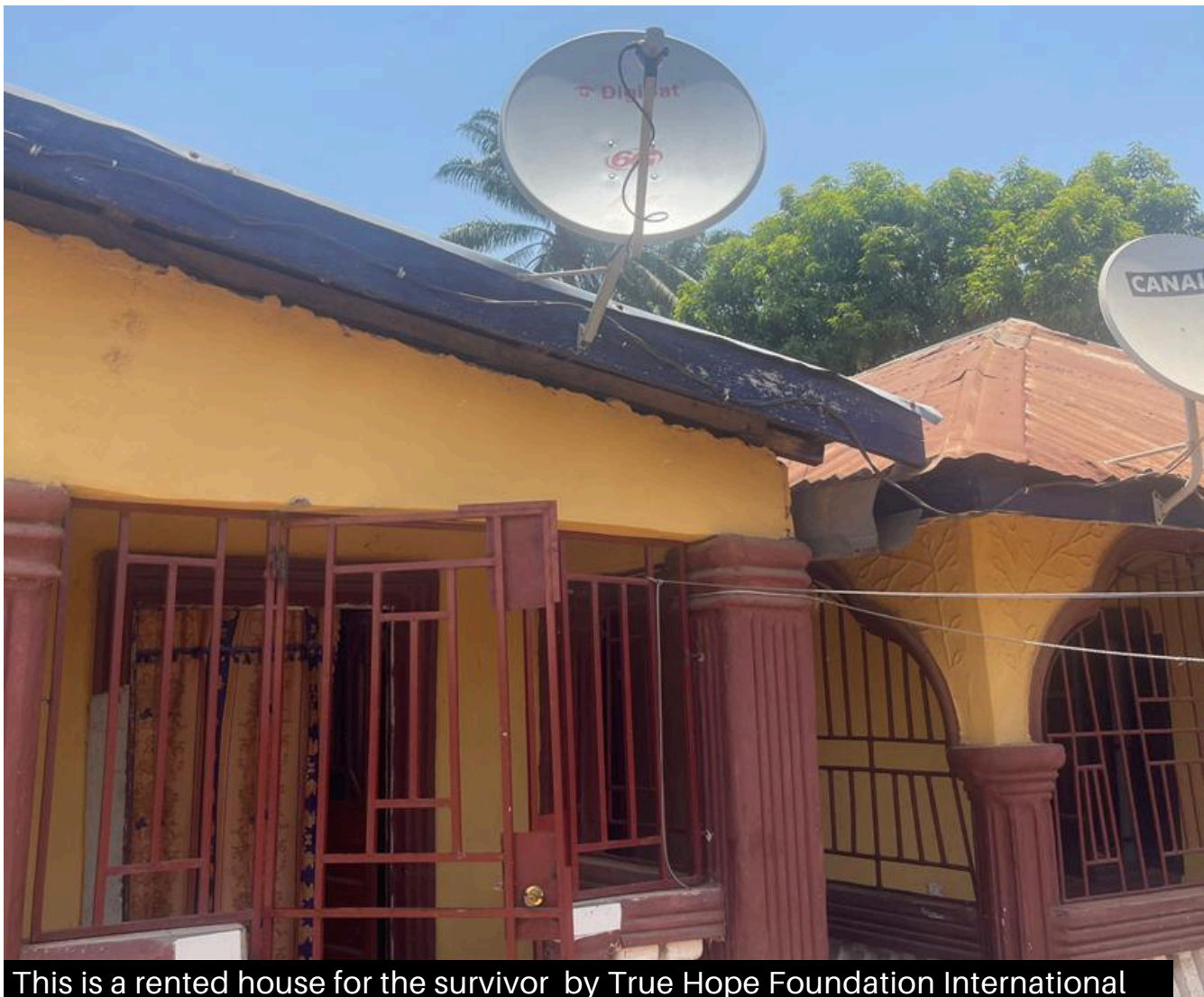
This is a rented house for the survivor by True Hope Foundation International

The purpose of this housing is to Provide safe and secure housing for our survivors in a supportive and trauma-informed environment, promote the physical, mental, and emotional well-being of survivors through access to stable housing, offer a range of support services and resources to help survivors address their immediate housing needs and long-term stability. Providing housing facilities for trafficking survivors is a critical step in supporting their Security, recovery, healing, and empowerment. By offering survivors a safe and supportive place to call home, the foundation believes that it can help them rebuild their lives with dignity and resilience.