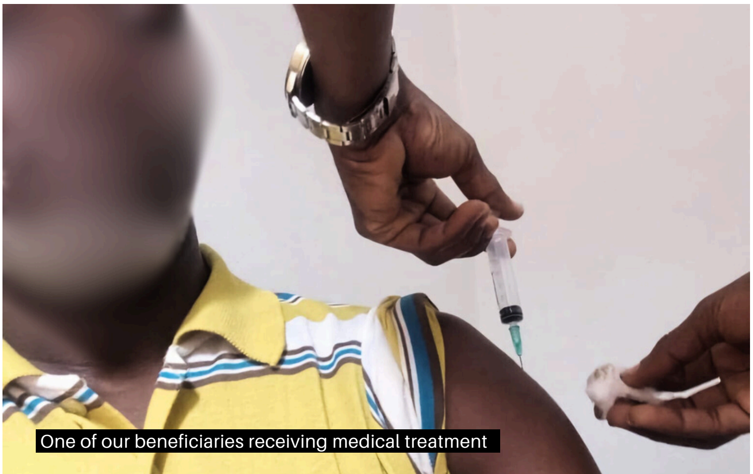
One of our beneficiaries receiving medical treatment

The package also includes mental health support which includes therapy, counseling, and other psychiatric care. A total of over Thirty Thousand Leones (SLE30,000) at a private medical facility in Sierra Leone. On the 4th of October 2024, one of our survivors received full-time medical treatment at Saint H.B. Hospital. The foundation has also specifically provided and facilitated the ongoing typhoid vaccination for our survivors and staff members. At True Hope Foundation, we are dedicated to providing trafficking survivors with access to quality healthcare services, tailored to their unique needs and experiences. Through our trauma-informed approach, multidisciplinary care team, and commitment to survivor-centered care, we strive to create a healing environment where survivors can thrive, heal, and reclaim their health and well-being.