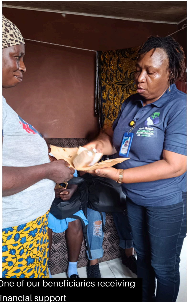
One of our beneficiaries receiving financial support

The economic empowerment scheme for the families of our survivors is a powerful tool for promoting economic empowerment, and sustainable livelihoods. By investing in the financial independence and entrepreneurial potential of these families, we are helping them rebuild their lives with dignity and resilience, making a meaningful impact in the fight against human trafficking and supporting the survivors on their path to recovery and success.